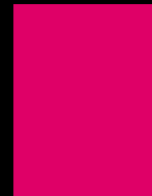
Hot Pink 215C