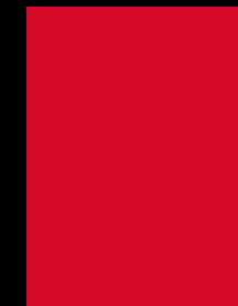
Strawberry Red 199C

Premier uses the Pantone Coated system as a guide. Fabric colour may vary slightly from the Pantone number given.