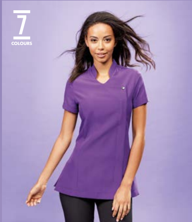
PR683 Blossom Tunic