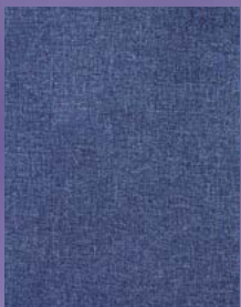
Blue Heather 2378C