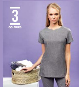
PR688 Viola Tunic