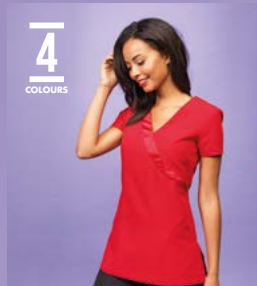
PR690 Rose Tunic