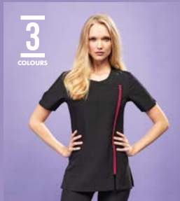
PR686 Camellia Tunic