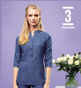
PR685 Verbena Tunic