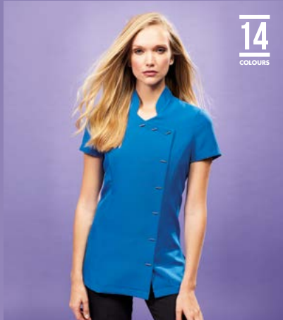
PR682 Orchid Tunic

Ask for more details on the complete beauty and healthcare collection from Premier.