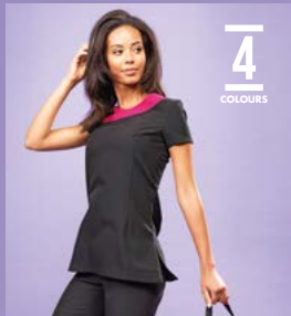
PR691 Ivy Tunic