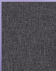
Black Heather 432C

Choose from the Verbena Button-Up Tunic or the Viola Cut-Neck Tunic and team with a pair of colour-matching Iris salon trousers.