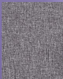
Grey Heather (Cool Grey 10C)